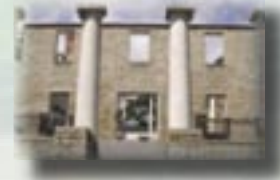
Patapsco Female Institute