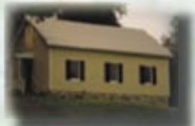
Ellicott City Colored School