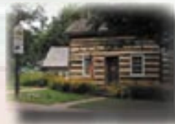
Thomas Isaac Log Cabin

We are featuring the local attractions maintained by The Howard County Consortium to promote tourism in our town and the local community.