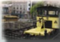
B & O Railway Museum