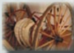
Ellicott City Fire Station