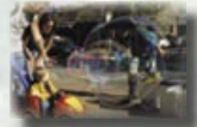
Ellicott City's Bubble Man

For more information on any of these attractions, please visit www.ellicottcity.net